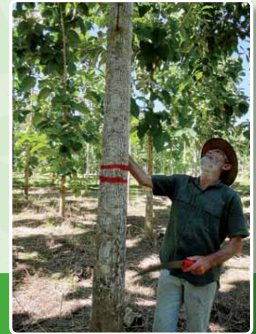
Photo: 4 year old Teak, 15m height, 20cm DBH.

The Company is focused on maximising production, yields and returns to shareholders. At the same time, Future Forests (Fiji) Ltd aims to be a fully integrated company at the forefront of sustainable forestry management internationally, and the emerging new environmental order.